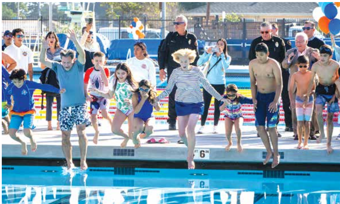
ON YOUR MARK.....GET SET..... GO!