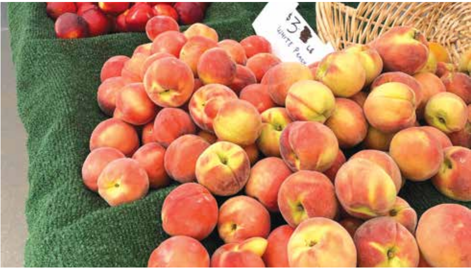
FRESH PRODUCE abounds at the BFM, now located at Town Center Plaza at 16521 Adenmoor Avenue in Bellflower. Open Mondays 3pm-7pm except holidays.