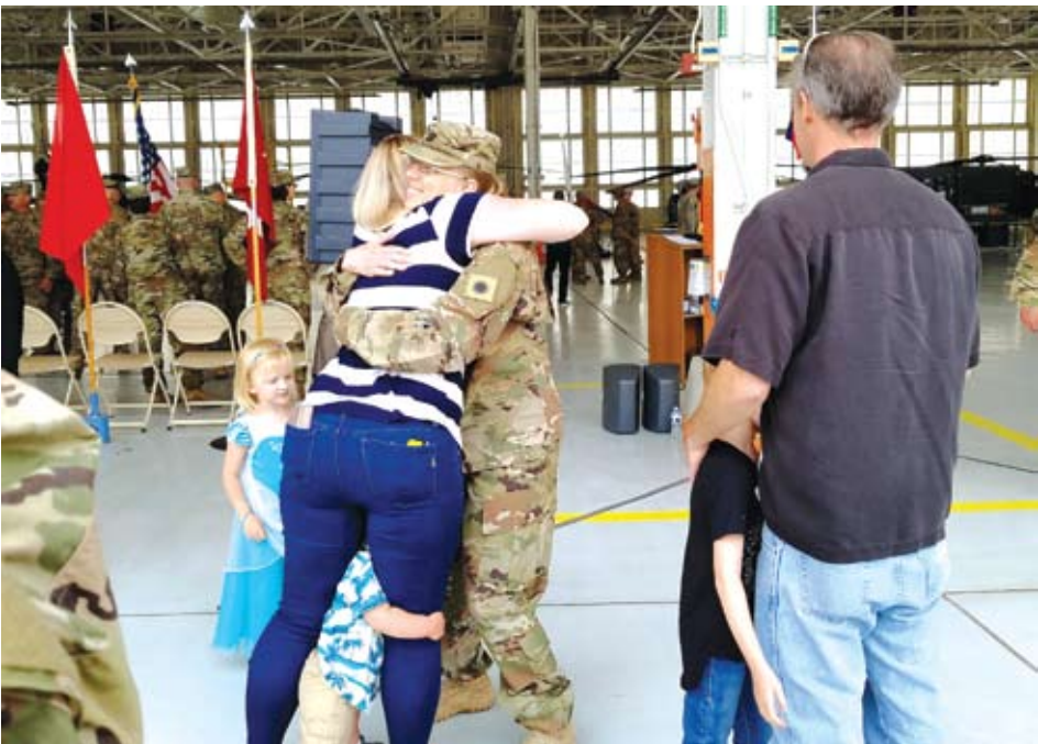
40TH INFANTRY DIVISION member giving her goodbyes to her family before deployment. The American Legion Auxiliary partnered with Veterans Voice Long Beach to provide drinks, cookies and set up support for the Deployment Ceremony.