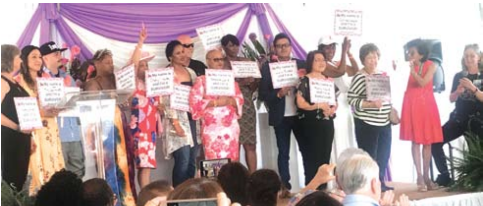
CANCER SURVIVORS hold up signs proclaiming they are survivors during National Adult Cancer Survivors Day. Kaiser held their event on Friday June 1st at their Rosecrans facilities in Bellflower. Nearly 300 members of the community attended the annual celebration of life event.

According to the National Cancer Survivors Day Foundation, there are nearly 14 million Americans living with a history of cancer. Today more than ever, people are surviving cancer because of advances in prevention, early detection, treatment and follow-up care.