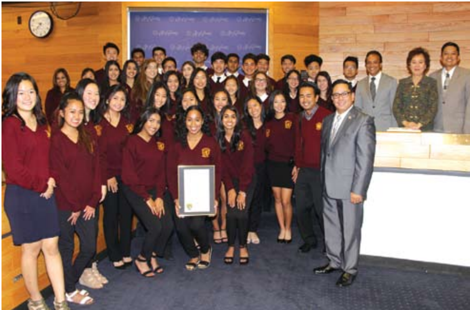
WINNING PERFORMANCE CHS students who won the 44th annual National High School Model United Nations Conference in New York in March.

The Cerritos City Council presented a proclamation to Cerritos High School for its winning performance at the 44th annual National High School Model United Nations Conference in New York in March.