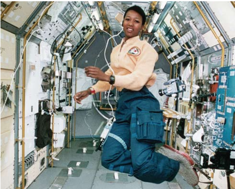
MAE JEMISON weightless during he space flight onboard the Shuttle Endeavor in 1992. She became an astronaut in 1988.

In honor of Black History Month, the Bellflower Unified School District [BUSD] celebrates the achievements of Mae Jamison, the first black woman to travel into space as a mission specialist aboard the Space Shuttle Endeavour. Jamison logged 190 hours, 30 minutes and 23 seconds in space and orbited the Earth 127 times. She has been inducted into the National Women's Hall of Fame and the International Space Hall of Fame. Mae Jemison, born Mae Carol Jemison, October 1956, moved with her family to Chicago at the age of three. She was introduced to science by her uncle and developed interests throughout her childhood in anthropology, archaeology, evolution, and astronomy. While still a high school student, she became interested in biomedical engineering, and after graduating in 1973, she entered Stanford University at the age of 16. There she received degrees in chemical engineering and African American studies. In 1977 Jemison entered medical school at Cornell University in Ithaca, New York, where she pursued an interest in international medicine after volunteering for a summer in a Cambodian refugee camp in Thailand. She graduated from medical school in 1981, and, after a short time as a general practitioner in Los Angeles, she became a medical officer with the Peace Corps in