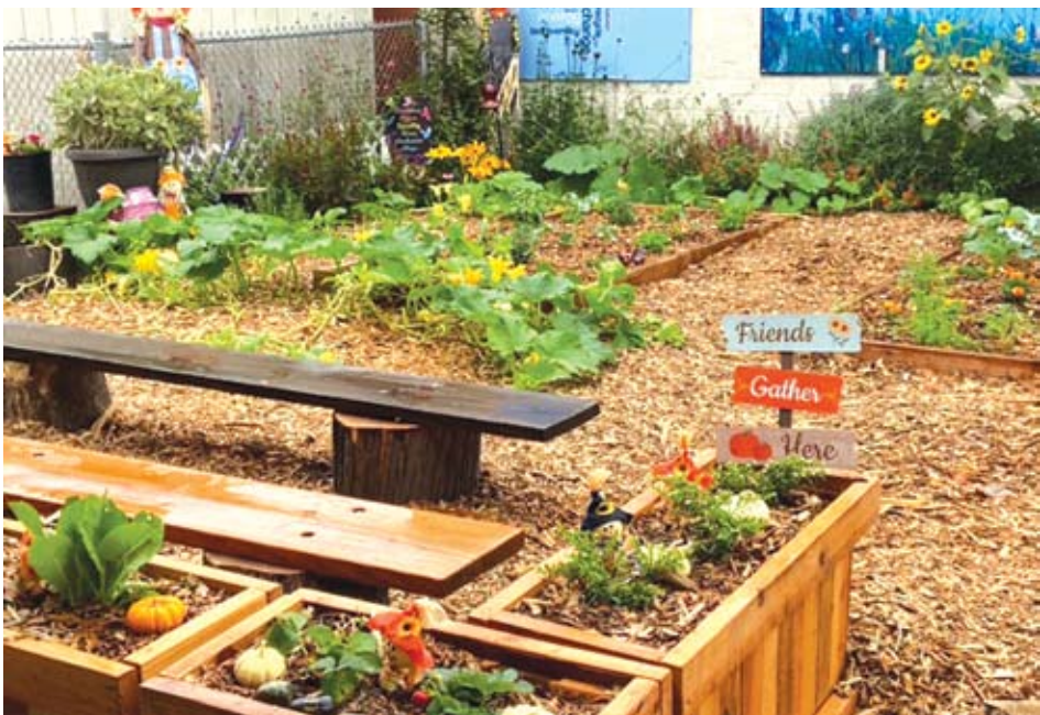
PALMS OUTDOOR GARDEN area has vegetables and also serves as an outdoor education site where students engage in cross-curricular learning.