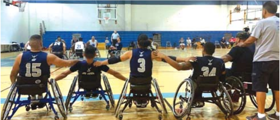
THE RANCHO HALOS ranked high enough to compete in the 2022 Nationals.