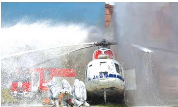
PFOS is found in, among many other things, fire-fighting foam.

The EPA on Wednesday issued nonbinding health advisories that set health risk thresholds for PFOA and PFOS to near zero.