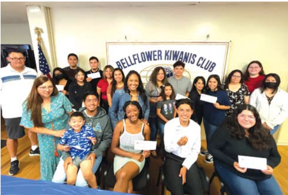
BIG CHECKS: Recipients of the Bellflower Kiwanis scholarship awards from Bellflower High School with their families collectively received $18,500 in funds.