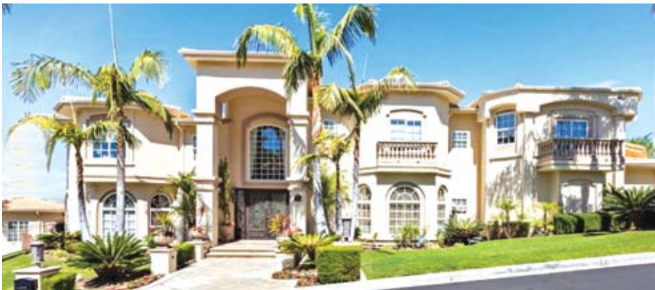
PARTIAL FRONT OF HOUSE , around the corner is the three car garage. 2nd picture is the backyard resort-style pool; 3rd picture is a massive kitchen with top-notch equipment and Italian tile; 4th picture is a fully packed wine cellar/humidor.

any claim by Solanki that he lives in his home Cerritos.