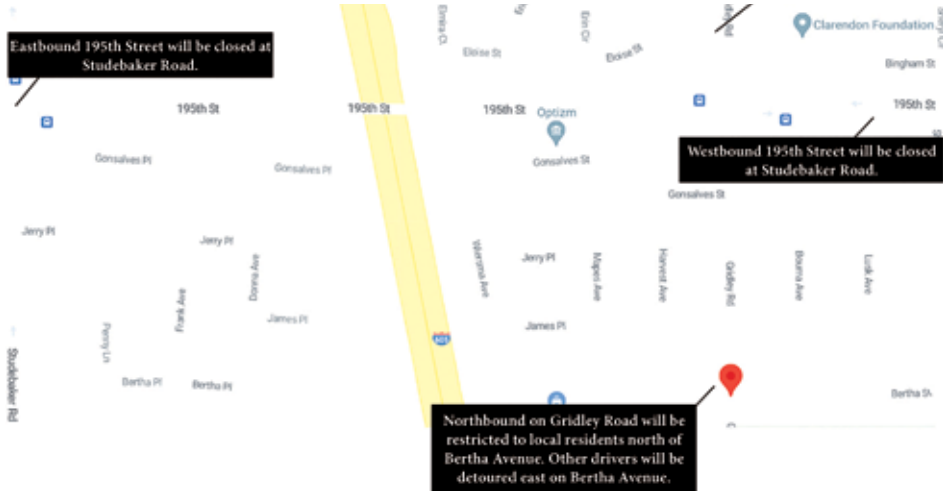
MAP SHOWING streets that will be intermittently closed during the sewer repair.

A water main shutoff for sewer repairs caused sediment to stir up, resulting in brown water at some homes in Cerritos the city indicates the water is safe.