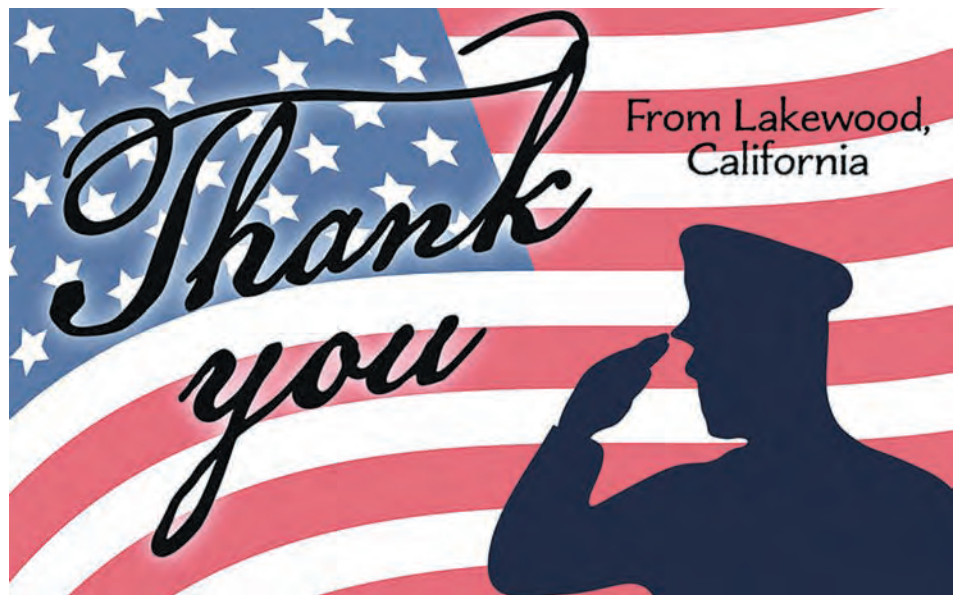
WINNING DESIGN from 2021, deadline to enter is August 11, all ages are welcome.