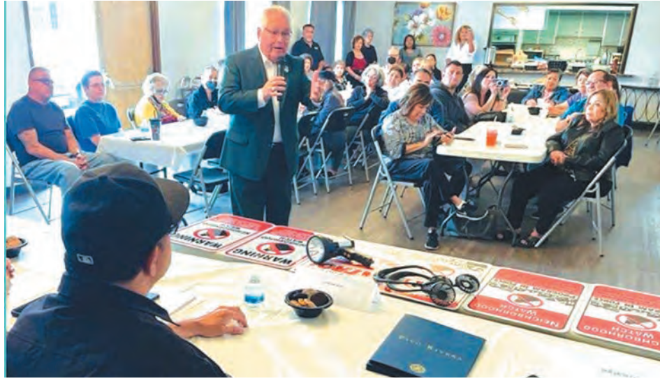
STATE SENATOR Bob Archuleta (D-Pico Rivera), addresses and congratulates the volunteers who patrol the Villa Nova Mobile Home Park during last months ceremony.