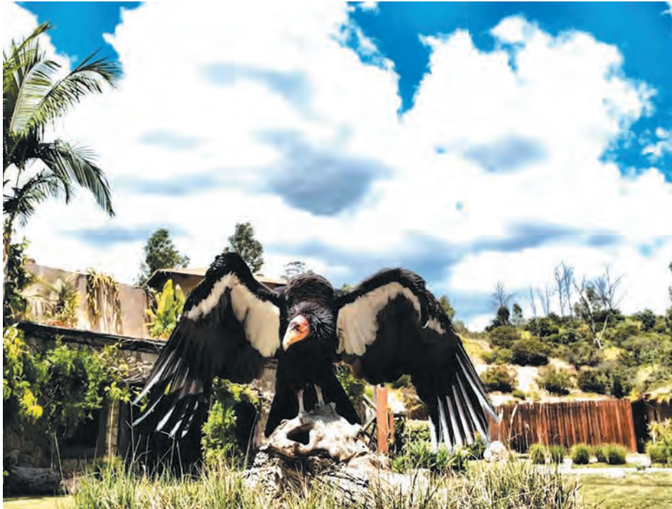
A CALIFORNIA CONDOR perches on a wooden stump at the Los Angeles Zoo.

LOS ANGELES, CA — The City Council green-lighted a revised plan Wednesday that will guide the physical transformation of the L.A. Zoo and explore the feasibility of expanding transit service to get there.