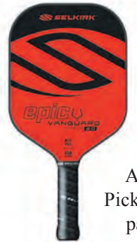
A $250 Pickleball paddle.