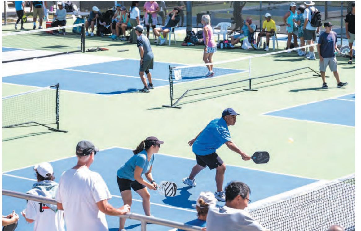
ZERO-ZERO-TWO: Area residents playing on the new Pickleball courts at Don Knabe Park. Attendees were treated to coffee and doughnuts and free play with lessons.