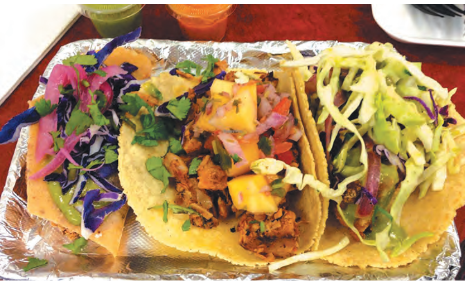
STR8 UP TACO’S Al Pastor taco especial plate with pickled onions, cilantro and salsa.