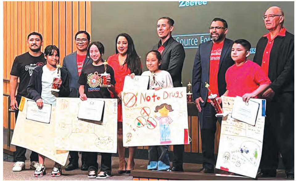
THE HAWAIIAN GARDENS CITY COUNCIL recently recognized Furgeson Elementary School students for winning the Red Ribbon Week Poster Contest, October 23-27. All students received certificates and trophies, along with winning entrants from other city schools. Each year all area cities and school districts sponsor activities to remind students of the dangers of illegal drug use.