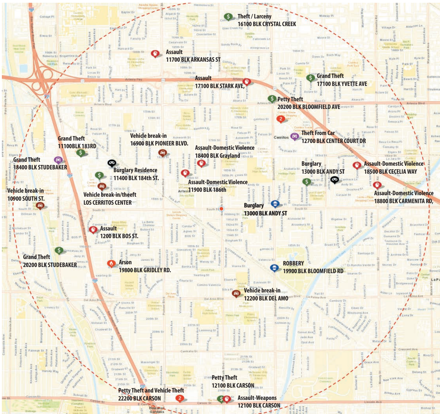
Map created by Los Cerritos Community News