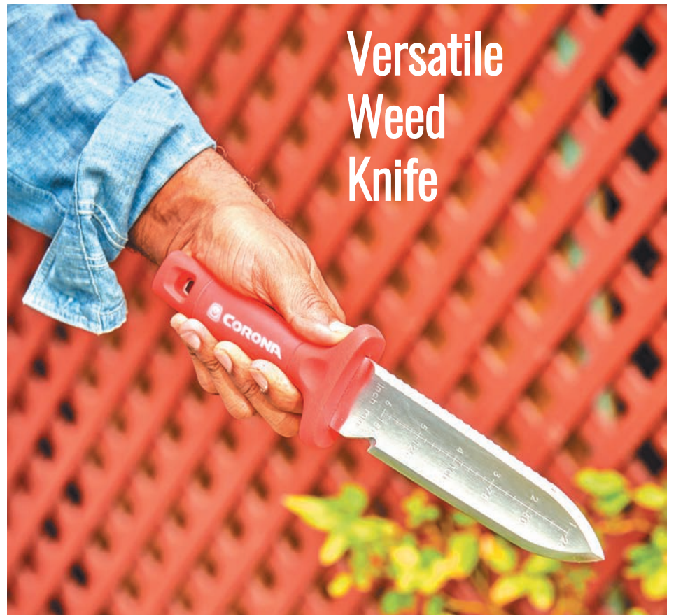
WEED KNIVES , like this Hori Hori knife, are multi-purpose as they can be used for cutting through sod and roots, planting bulbs, digging weeds, and more.

Drop a pair of snips in their stocking and they are sure to thank you any time they deadhead a flower, snip off a way-